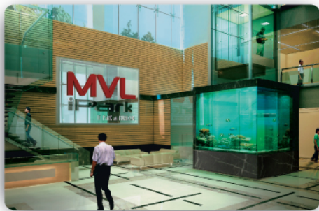
Entrance Lobby at iPark

After all, your office does speak a lot about your business.