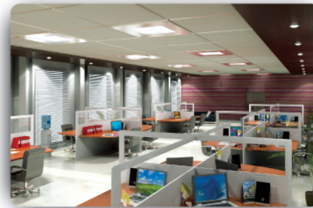
Work Space at iPark