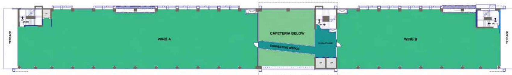
SIXTH FLOOR PLAN