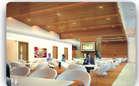
Cafeteria at iPark