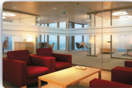
Meeting Lounge at iPark