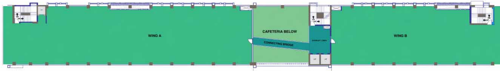
FIFTH FLOOR PLAN